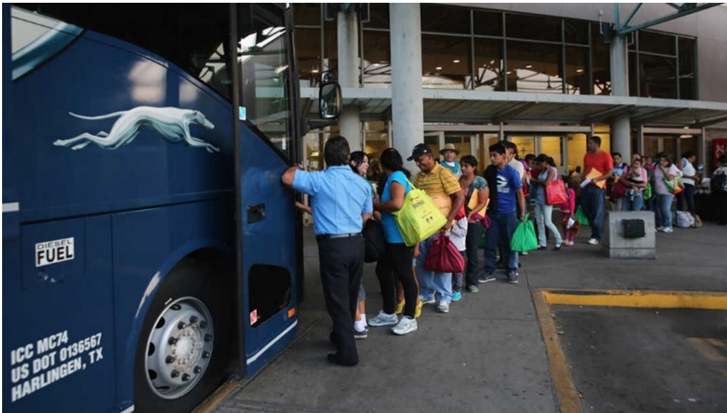
Texas Governor Abbot

continues to send migrants to those big blue cities up north. Chicago and New York are losing their minds as the migrants, long intended to dilute red states but not blue cities, impact local politics.