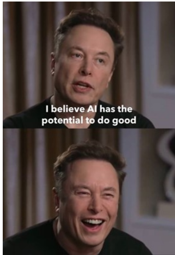
The A.I. Apocalypse

https://www.2thepointnews.com/skyes-links-042023/