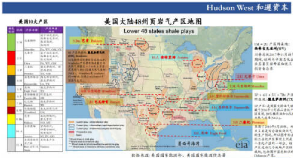
Figure 2: (Translation from Mandarin Chinese) Map of Shale Gas Producing Areas in the 48 States of the Continental United States