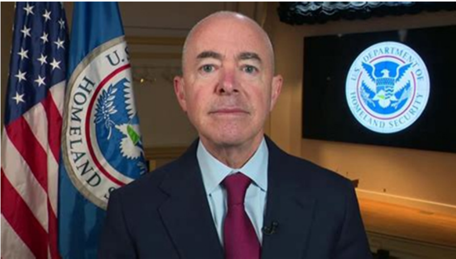
Homeland Security Head Myorkas

We will see which government officials and agencies have integrity; whether they practice what they preach. The media already recognizes the significance of this storm to the future leadership of Florida, the nation, and the continued decentralization of power to the states. The media is eager to move along to any other story they can spin up, so damaging is the truth to their agenda.