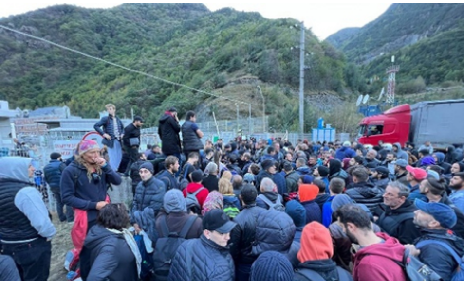
Over 200,000 Russian men fled from