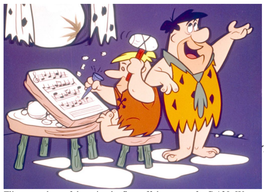
The battlefield is now well beyond the Fred

The military urgently needs modernized psyop warfare dogma and soldiers possessing the training and intellect to fight in the highly contested information domain. Unfortunately, the military's efforts to demonize virtue and discipline as it pursues purple-haired and mentally malleable young women make a joke of the deep technical preparation required for modern information warfare.