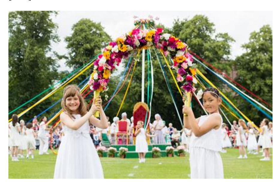
What May Day should be, happy and joyous