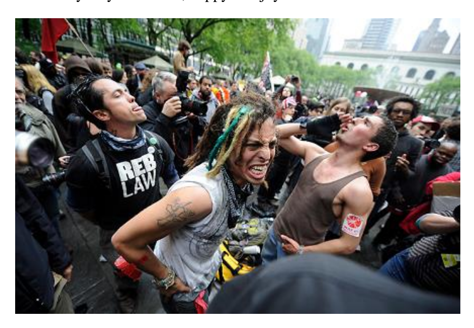
What Commies and the Fascist Left have done to May Day